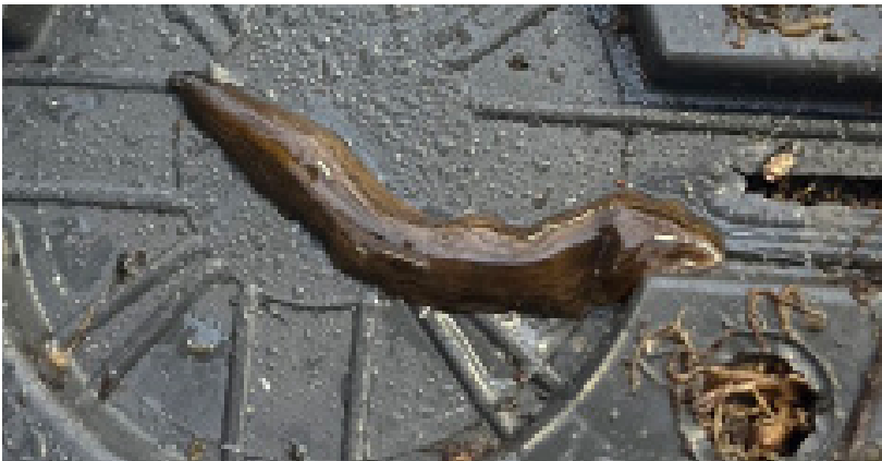
Adult worm underside of container.