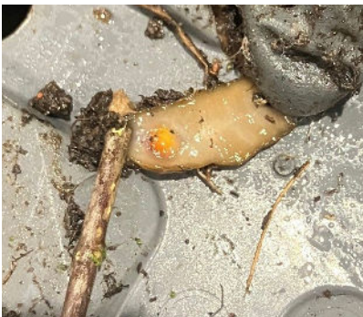
The underside of the worm with an orange egg capsule.